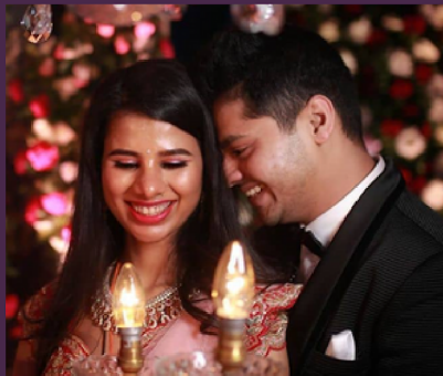
GROOM AND GROOMSMEN Bangalore | Outstation Know More