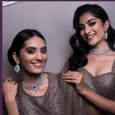
PRE- BRIDAL PACKAGES GnG Salon Exclusive Know More