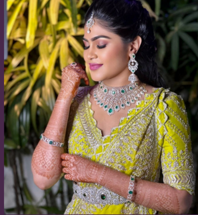
NON - BRIDAL PACKAGES Bangalore | Outstation Know More