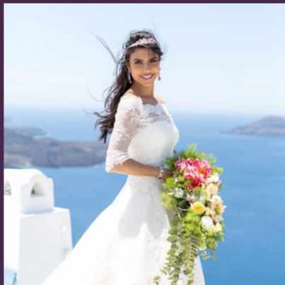
DESTINATION WEDDINGS Global Venues Know More